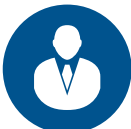
COOs, CEOs, VPs, Presidents, MD's