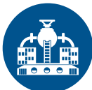
Planning and Change Leaders